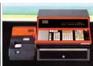
UTAX 4000 – cash desk system