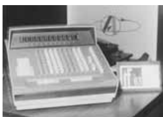
Anita – the first electronic desktop computer

This extensive history, experience and expertise gives us a firm foundation to provide you with world class solutions and services you and your customers need today and in the future.