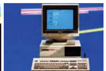
UTAX AT300 – compact desktop computer