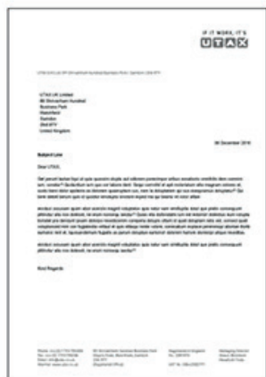
Mono Mono (no colour click)

If most of your printing is at Colour Level 1 or 2, you are probably being charged at Colour Level 3; with a UTAx device you only pay for what you use.