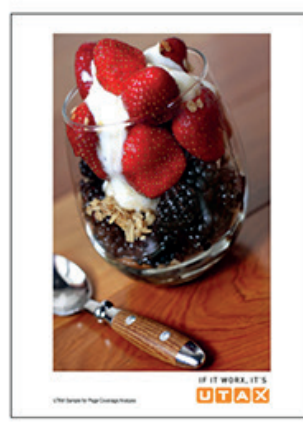
Colour Level 3: High Colour (20.1% and over)