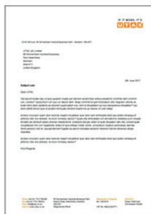
Colour Level 1: Low Colour (Up to 5.1%)